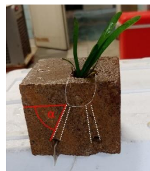
FIGURE 2 – Schematic detail and construction of one of the support devices with a shoot grown inside the main cavity (cm scale) and detail of the roots grown in the secondary cavities (mm scale)