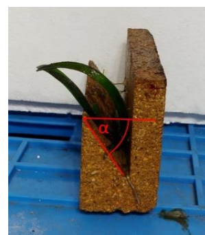
FIGURE 3 – Schematic detail and realisation of one of the support devices with a shoot grown inside the main cavity (cm scale) and detail of the roots