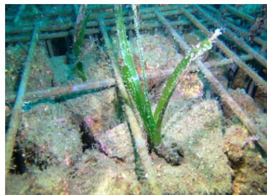
FIGURE 1 – Detail of a P. oceanica shoot in its support device after transfer to the sea